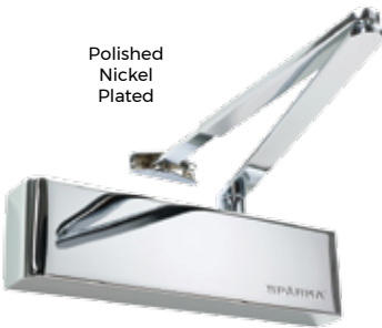
Polished Nickel Plated