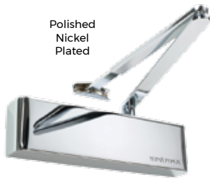
Polished Nickel Plated